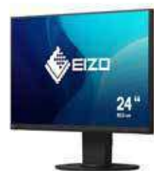
EIZO MEDICAL MONITOR with 7m video cable

Unique radiology and direct digital panel management software for immediate diagnosis and improved productivity